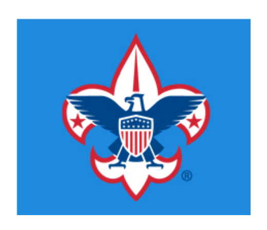
Prepared. For Life."