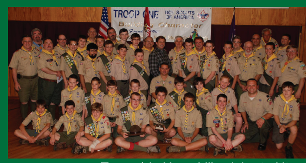
Troop 1 in Haverhill celebrated its 100th Anniversary