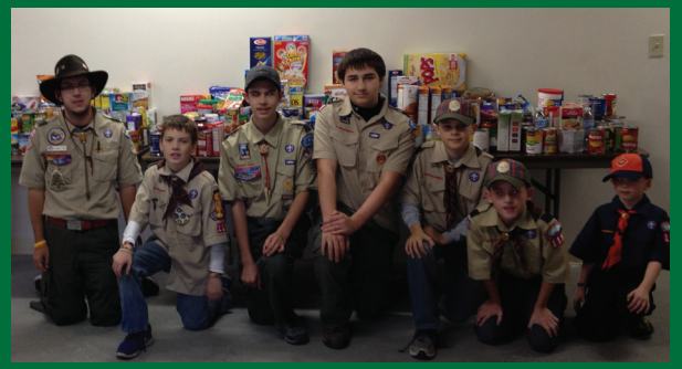
Scouting for Food in Peabody