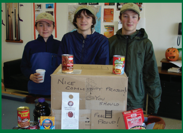
Scouting for Food in Amesbury