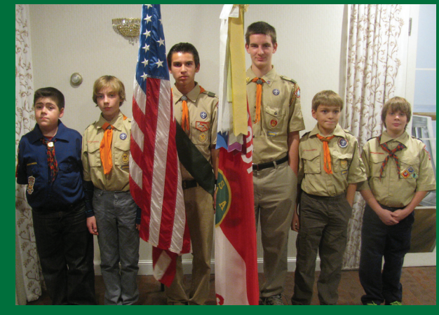
Wenham Scouts in Color Guard at The North Shore Distinguished Citizens Award Dinner

Yankee Clipper Council, BSA • 36 Amesbury Road • Haverhill, MA 01830-2802 • 978-372-0591 • www.yccbsa.org