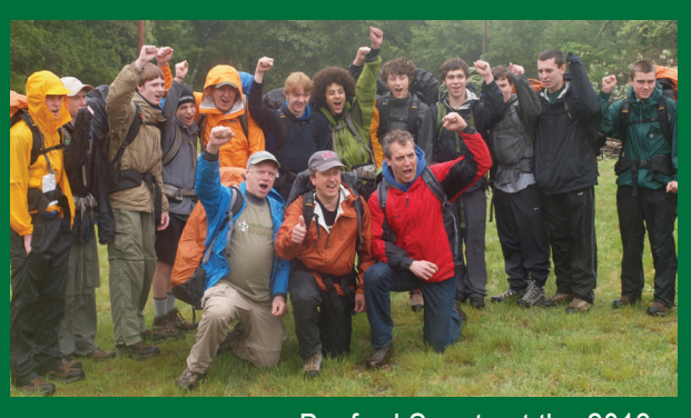
Boxford Scouts at the 2013 SCOUTStrong Hike at Topsfield Fairground