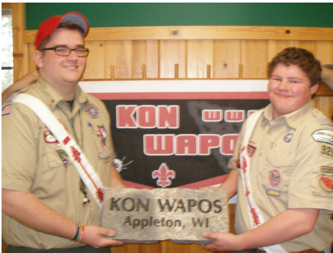
Our Legacy Rock is complete for the #LegacyProject. A huge thank you to Halquist Stone in Sussex, WI for donating the stone!